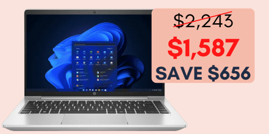
HP ProBook 440 G9 14" Intel i7 + 3yr Onsite Support

HP ProBook x360 435 G9 13.3" AMD R5 + Pen + 3yr Onsite Support 8GB RAM / 256 GB Storage