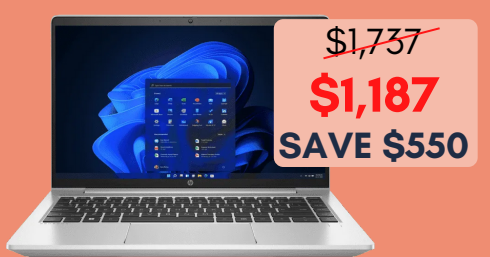
HP ProBook 440 G9 14" Intel i5 + 3yr Onsite Support 16GB RAM / 256 GB Storage