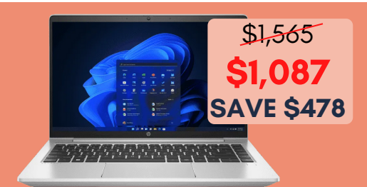
HP ProBook 445 G9 14" AMD R5 + 3yr Onsite Support 8GB RAM / 256 GB Storage

HP 240 G9 N4500 14" Intel Celeron + 3yr Onsite Support 8GB RAM / 256 GB Storage