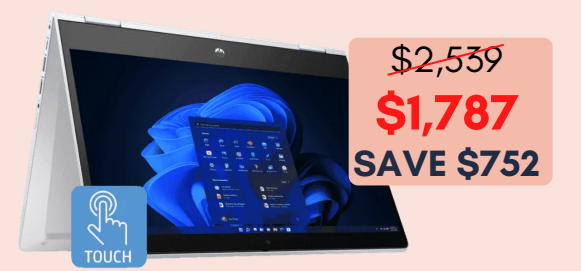
HP ProBook x360 435 G9 13.3" AMD R7 + Pen + 3yr Onsite Support 16GB RAM / 512 GB Storage

HP ProBook x360 435 G9 13.3" AMD R5 + Pen + 3yr Onsite Support 16GB RAM / 256 GB Storage