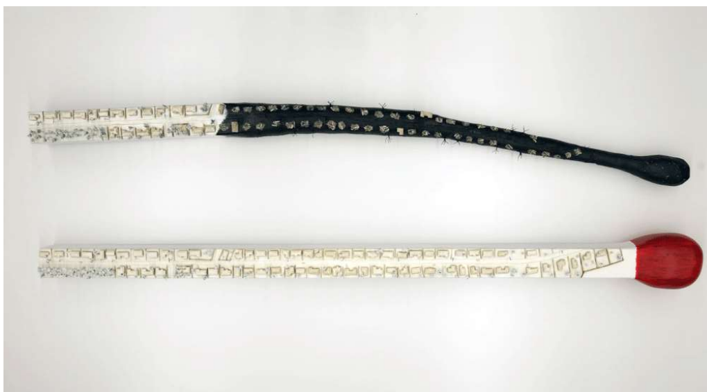
Gabrielle Knight – Burns Road, Springwood

The two Visual Arts students selected for this year's Artexpress exhibition are Gabrielle Knight and Stacey Simmonds .