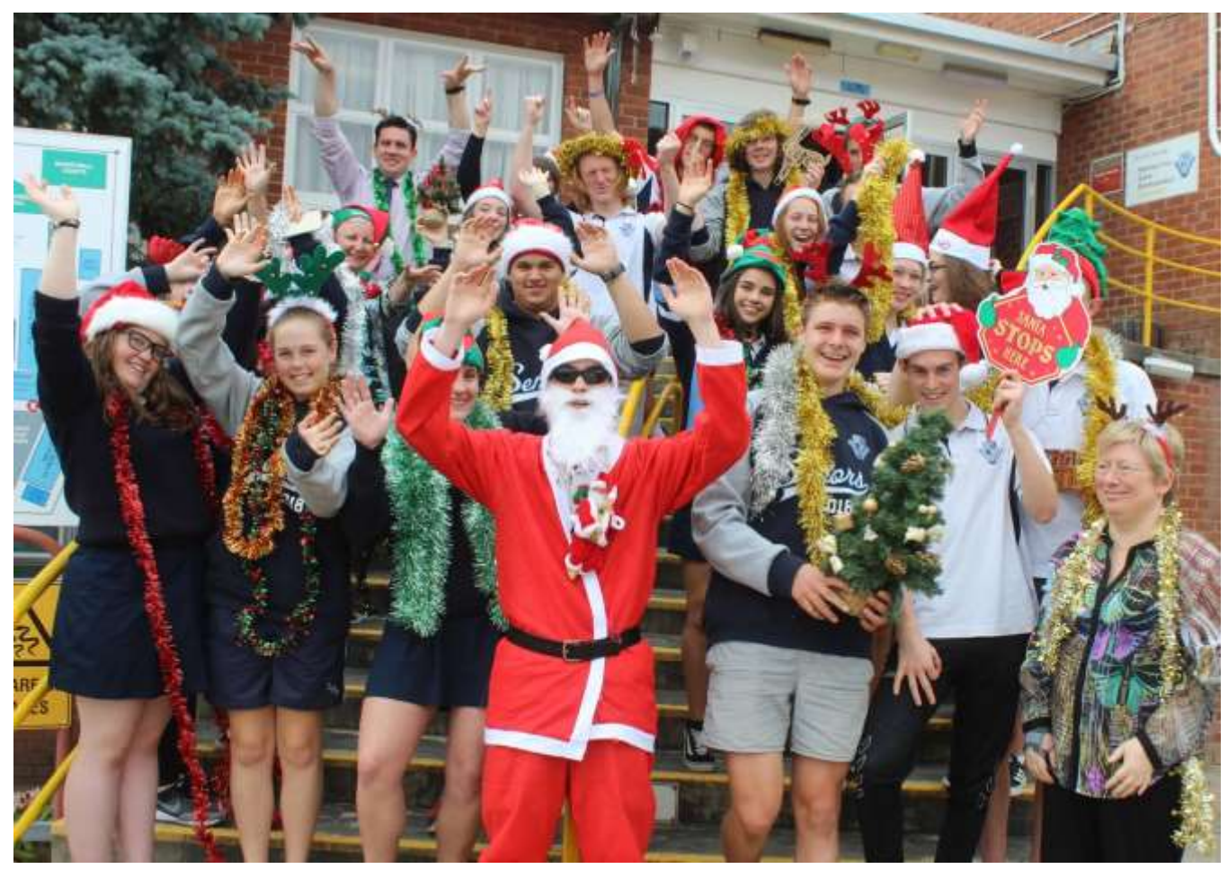
We hope you have a lovely, safe Christmas break