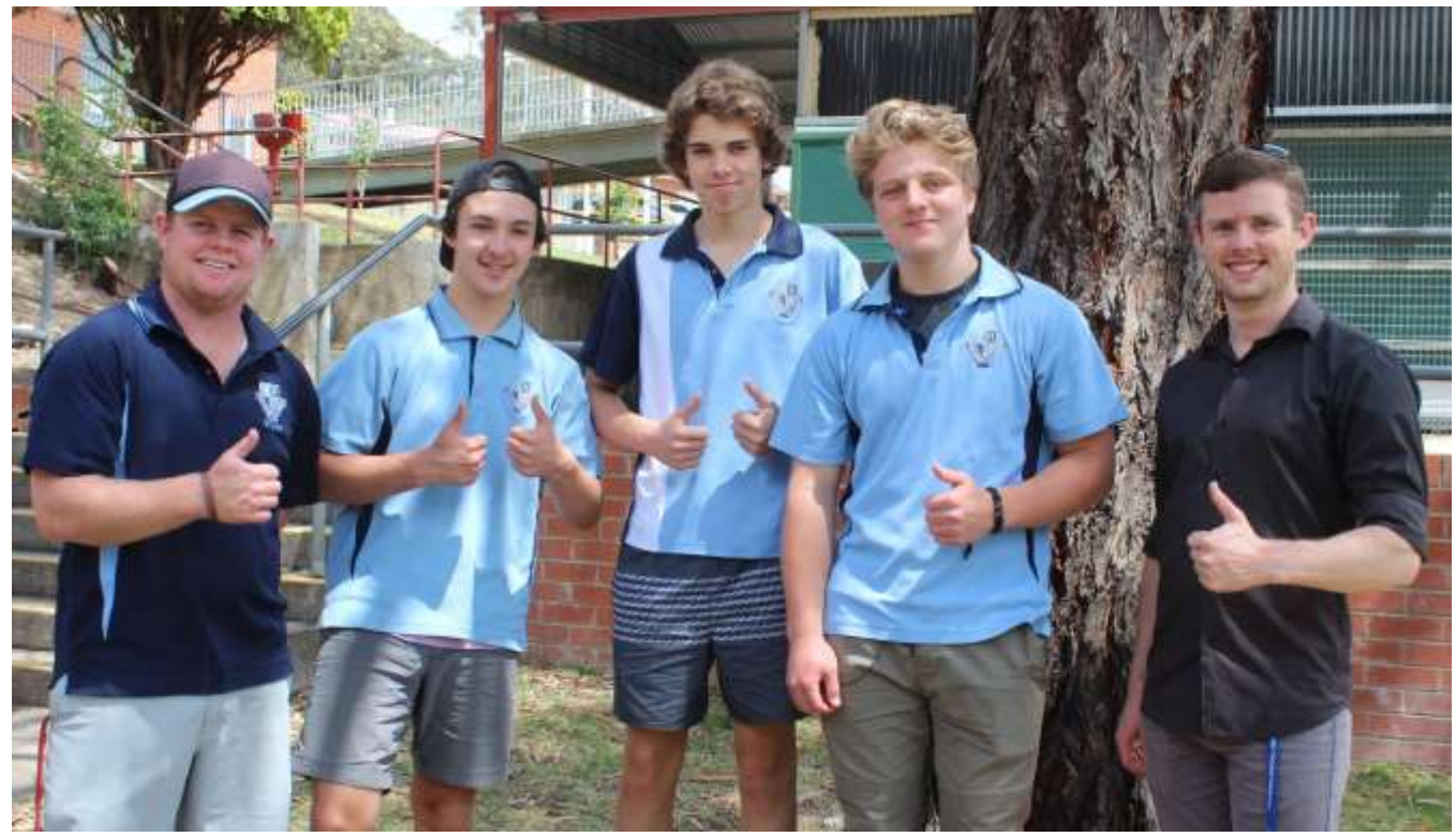
During November LHS students and staff have been supporting Movember, raising money and awareness of men's health issues.

Thank you to everyone for supporting this worthy cause and to our Mobrothers, the mos were well worth the effort and we raised almost $1000.00 towards much needed funds for this great cause. To our Mo sistas, your support during Movember was appreciated.